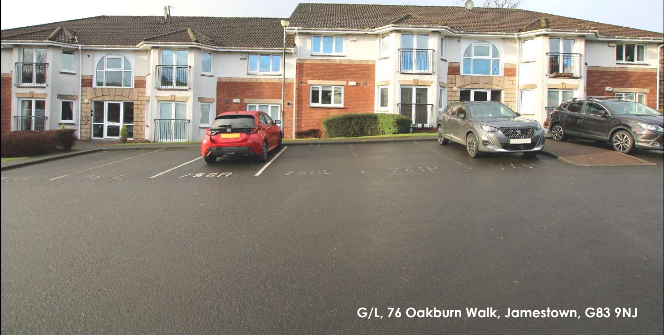
G/L, 76 Oakburn Walk, Jamestown, G83 9NJ

We are delighted to present to the market this larger style two bedroom ground floor apartment which is located in this extremely popular development built by the renowned Turnberry Homes.